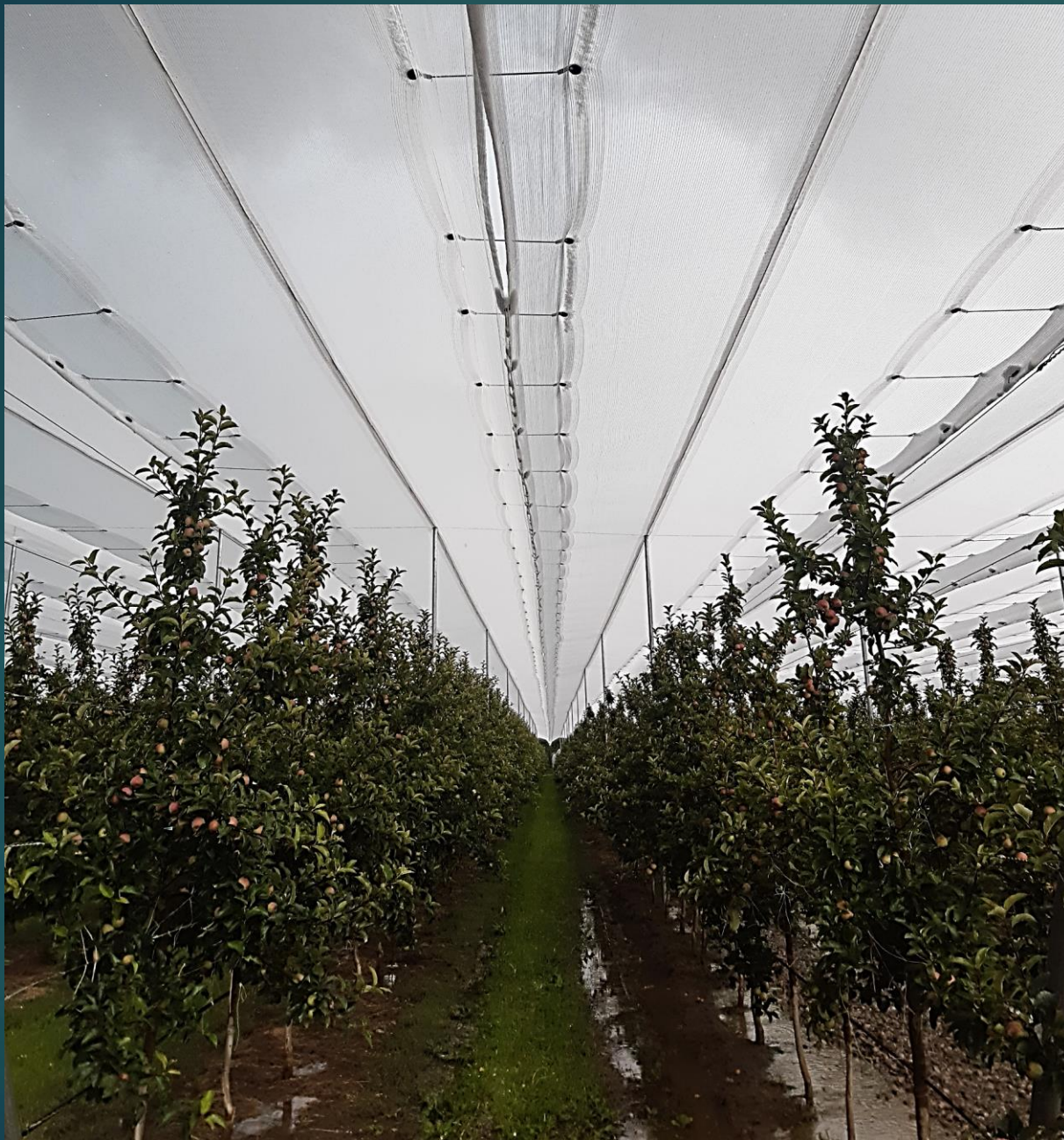
V-trellis hail structure