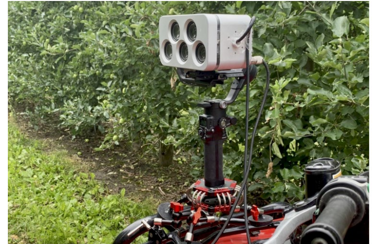
The Vivid X system uses a small spectral imaging sensor that is mountable to a tractor or golf cart to look at the tree to detect diseases and pests, count blossom clusters and detect and measure apples. Shown here is the prototype.